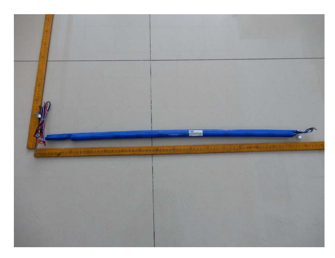
Figure 1 Top view of battery