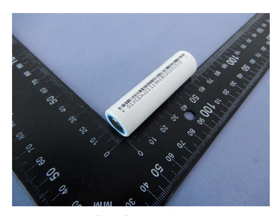
Figure 3 Overall view I of cell