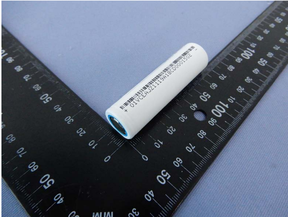
Figure 3 Overall view I of cell