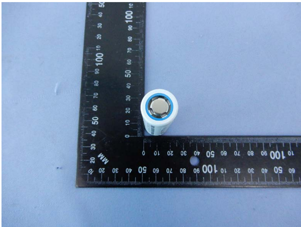
Figure 4 Overall view II of cell