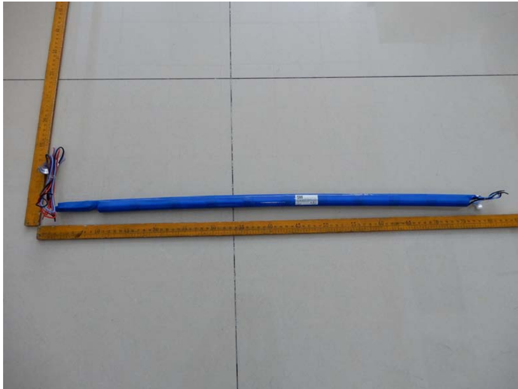
Figure 1 Top view of battery